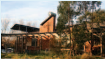
St Kilda Ecocentre

For details google any of those organizations.