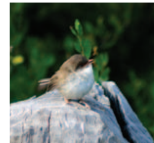
Wren hatchling at Ecocentre Westgate project