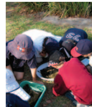
Albert Park school project