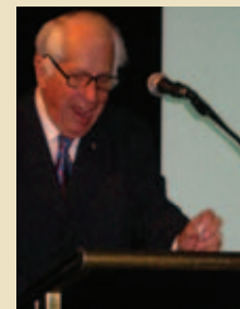
Sir Gus Nossal

It is a little over a year since the public launch of the Hamer Family Fund at Hamer Hall, with Sir Gus Nossal as the presiding genius. At the launch, our first grants were presented: one to a very fine student at the Victorian College of the Arts, and one to a community circus group.